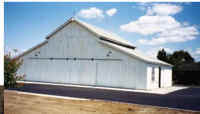
The Bianchi barn in its new location.