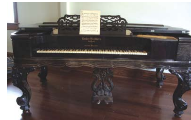
The grand piano today in its new home.