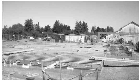
IN THE BEGINNING ...