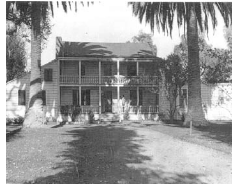
Original Martin Murphy, Jr. house