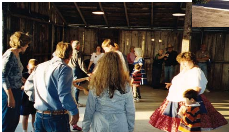
The barn dance celebration.